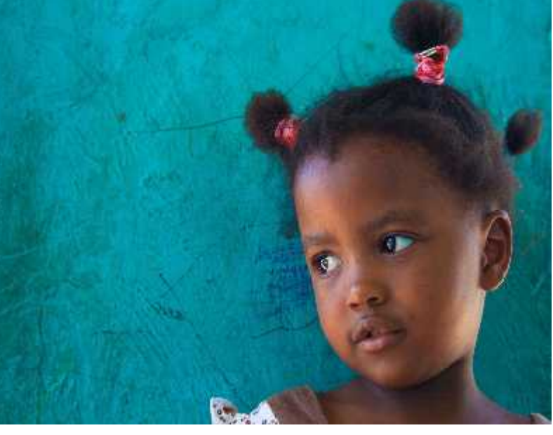
"I am grateful for the opportunity to be a part of these people's lives and to be able to help in even the smallest ways, the experience has been very humbling... I think the work on the community project is fantastic and feel African impact is a huge part of Khula Village, I have gained new perspectives on life in general and will take this experience and my memories with me forever"